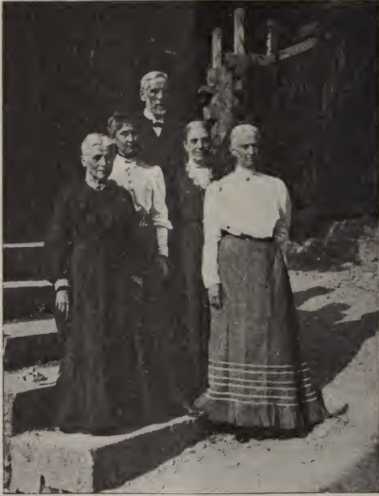
FIVE VETERANS OF THE JAPAN MISSION

In 1902 she began teaching the Bible women, and a glance into her well-stocked library shows she not only taught but studied, keeping abreast